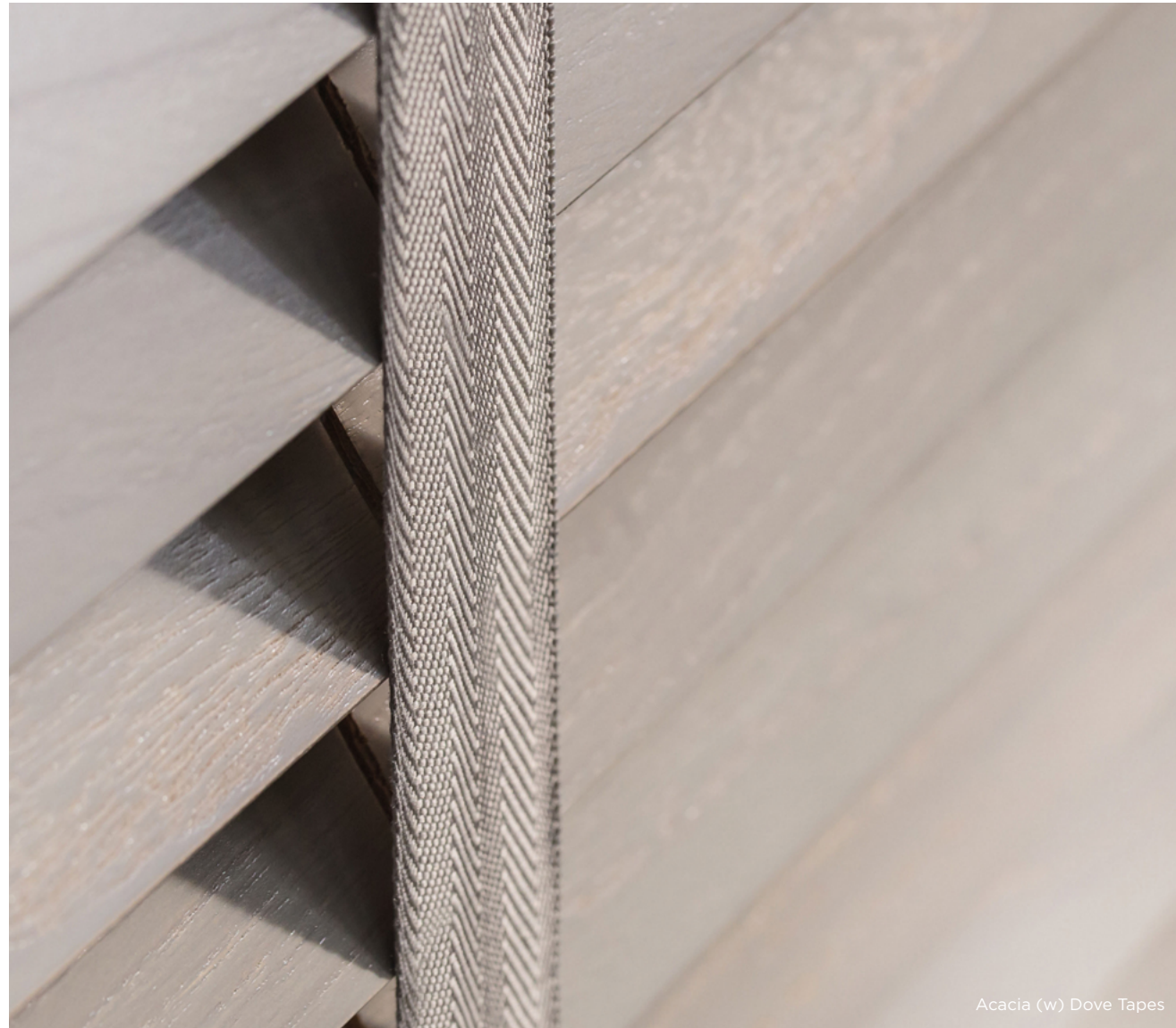
Acacia (w) Dove Tapes