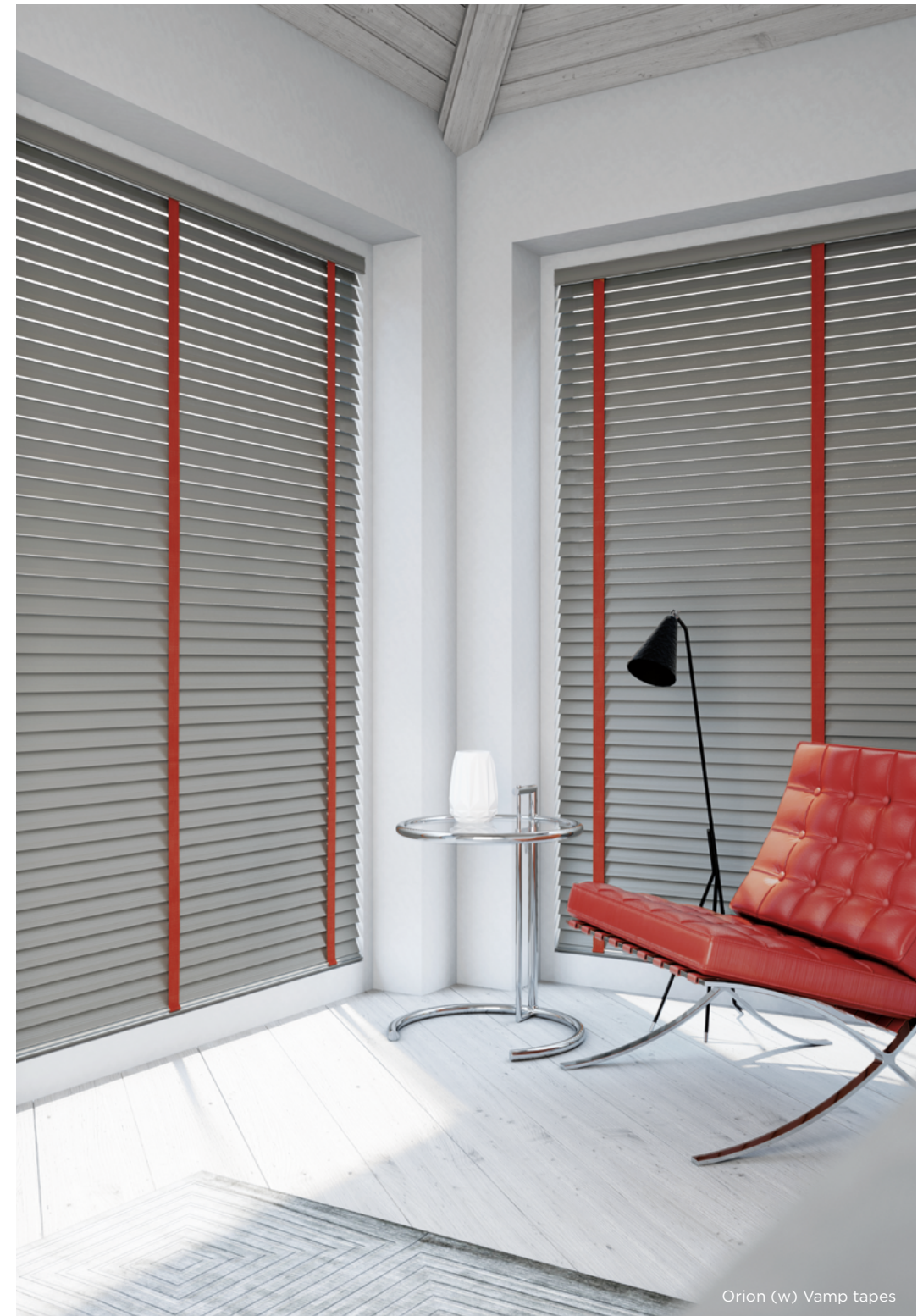
Orion (w) Vamp tapes

Emulating a sophisticated wood grain or a contemporary smooth finish, Faux Wood offers 35mm and 50mm slat widths. Crafted using high quality PVC, Faux Wood blinds are the perfect solution for areas of high moisture, such as kitchens and bathrooms.